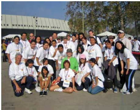
LA Marathon SOSMentor ShapeUp Team (partial group)