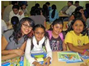
Santee HS Student Mentor with San Pedro ES Mentees